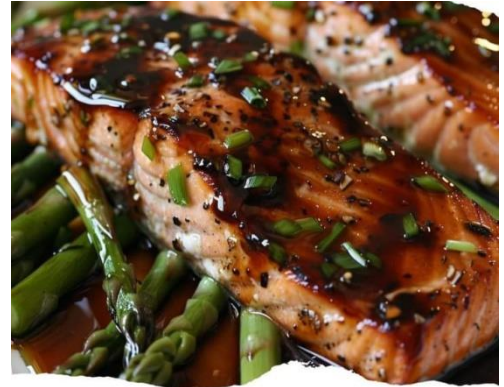
Balsamic-Glazed Salmon with Asparagus

Macros: Calories: 350 per serving, Protein: 25g, Fat: 22g, Carbohydrates: 8g