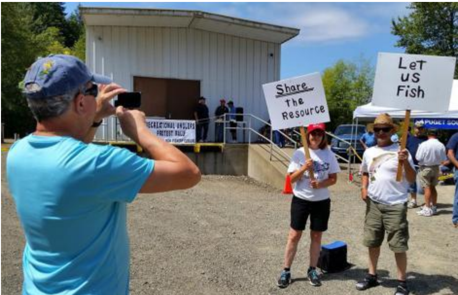
here were plenty of signs at the rally calling for fairness and equity in sharing the resource. Speaking of sharing, over the next few years WDFW will collect hundreds of thousands of eggs from surplus Baker Lake sockeye to help the Skokomish Tribe start a run of the salmon in Hood Canal. (ANDY WALGAMOTT)