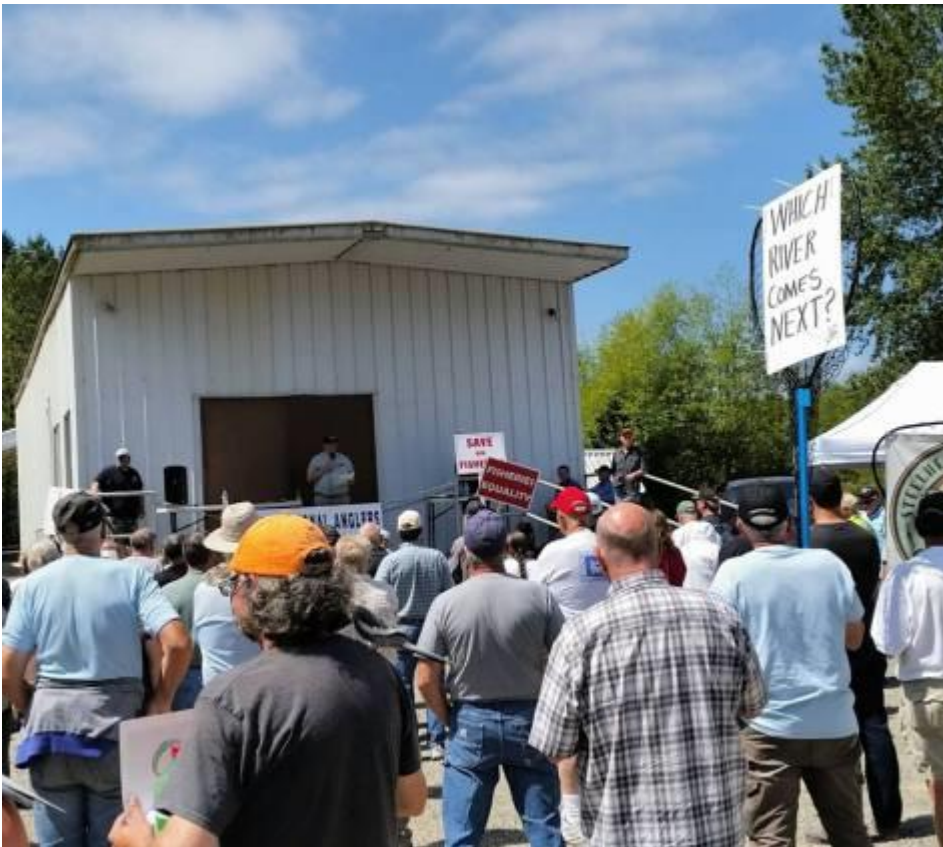
This year’s low forecasted returns of salmon to Puget Sound are a good reason to be cautious and conservative with seasons, especially for coho. But the Skokomish is one of the rivers forecast to see good returns of Chinook and coho, though sport anglers won’t be able to take advantage of that in large part.