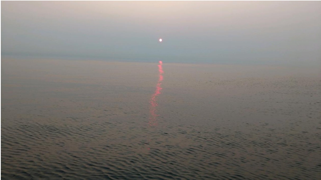
Sunrise on the water at Sekui in Carl's boat

Do you have a picture from your latest fishing adventures? Be sure to send it, with your descriptive caption to sof.psa@hotmail.com for your chance to have it be featured in the Hog Pen.