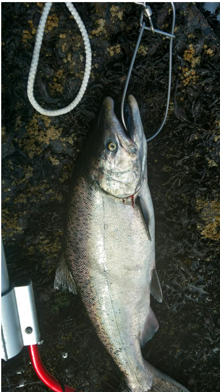
Duane Horton caught this nice king off of the North jetty at Long Beach