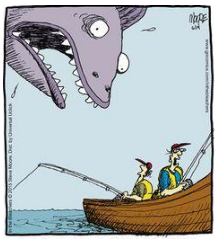
"That's a good sign, Liam! If the fish are jumping, it means they're hungry!"