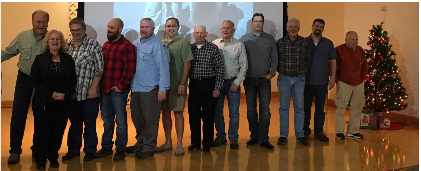
2017/2018 SOF Auburn Board of Directors

Meet our new club officers and Board of Directors!