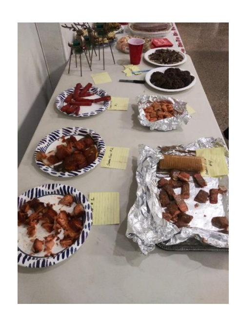
Stan Prescott was the winner of the smoked salmon contest