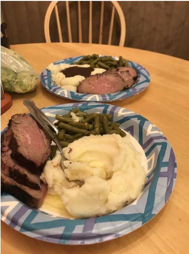
Tri-tip dinner at Miller Creek Ranch