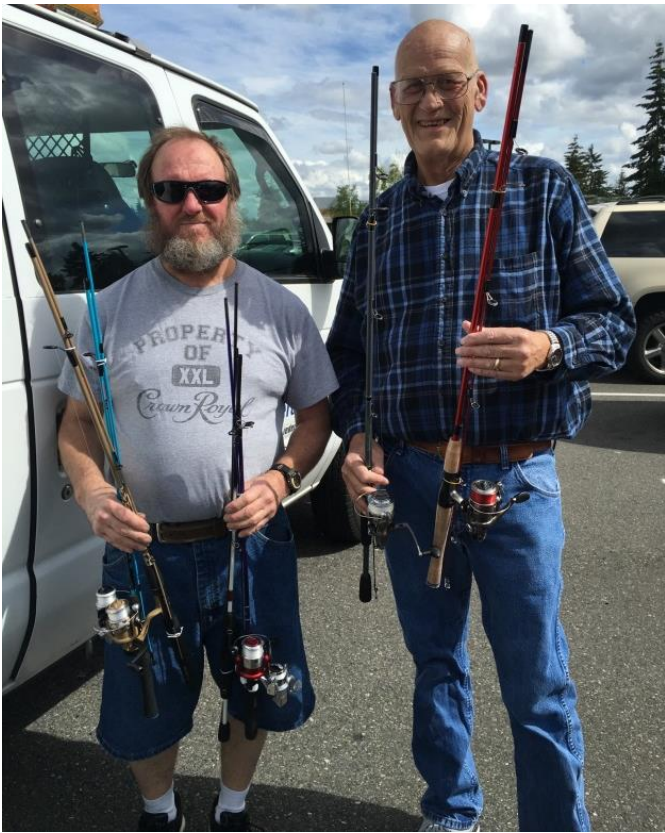
Net set-up crew