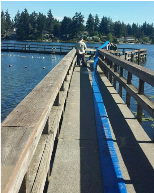
Fish delivery: tube along dock that fish are pumped through to the lake

We look forward to another great one next year! Hope to see more members out at this fabulous event!