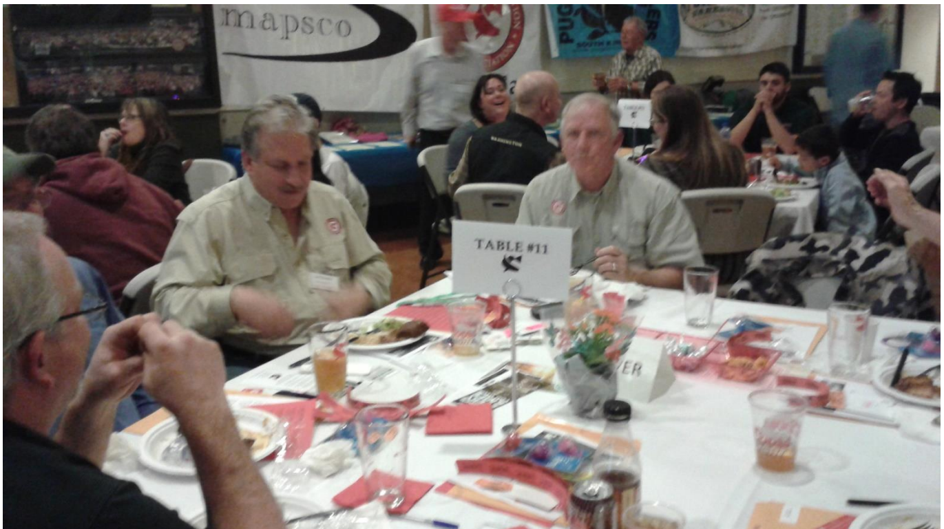
The Carver Table