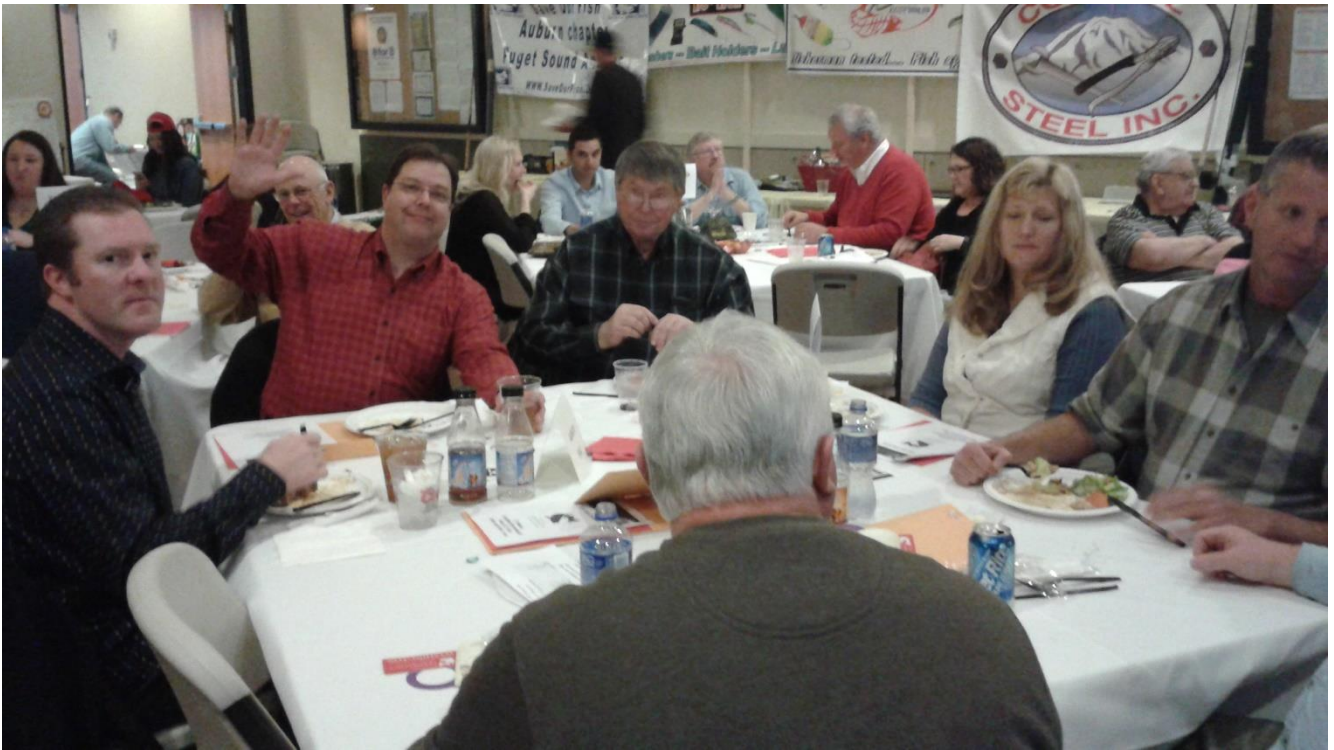
Several more tables with SOF Auburn Chapter members and guests