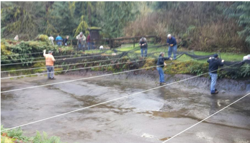
PSA and TU members putting protective net over upper fish pond. Rob Larsen in the pond pulling the net across.