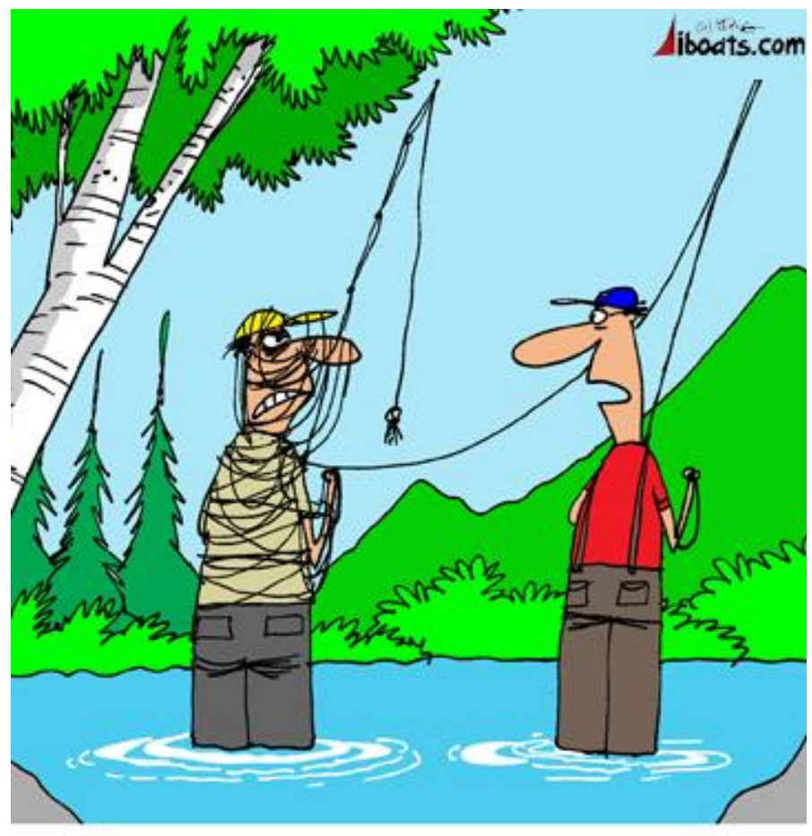
"Sorry. Casting when it's windy isn't one of my strong points."