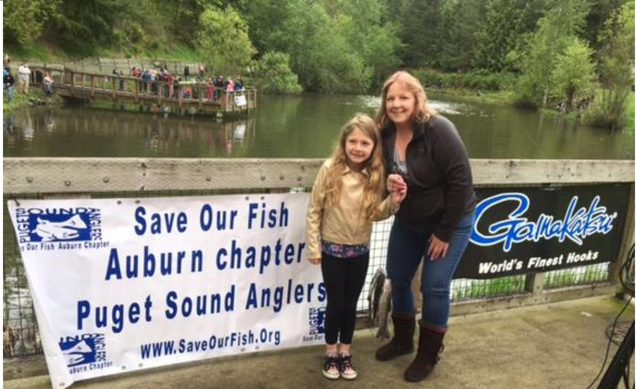
First ever fish caught!