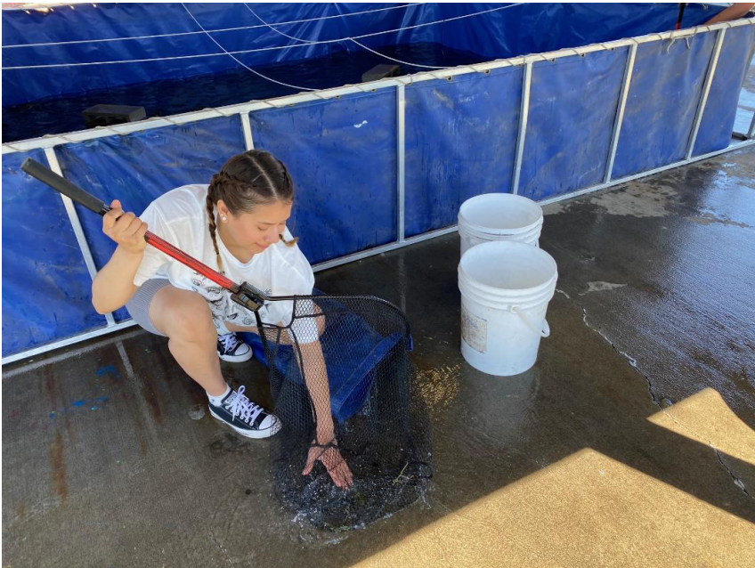
Draining the pond