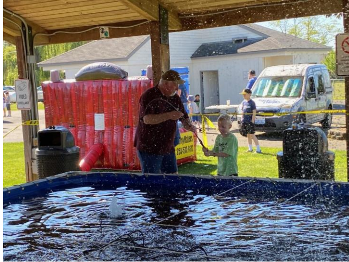
Algona Kids Derby Prize Winners