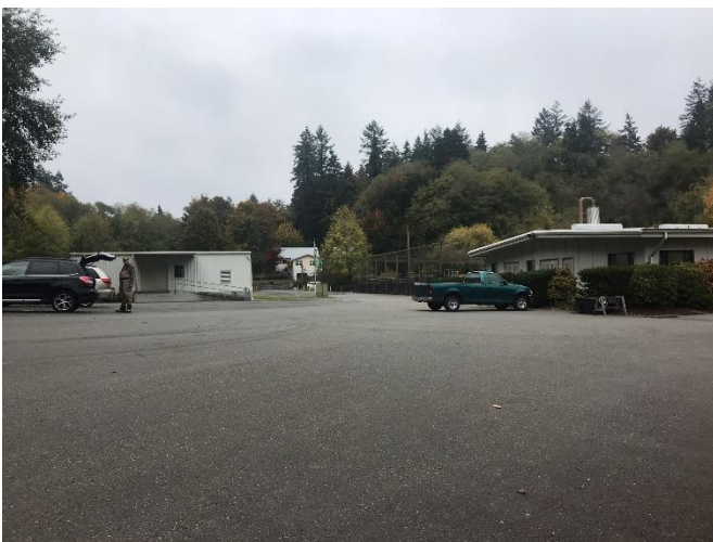
Minter Creek parking lot all cleaned up!

Rick Lavity and Rob Larsen did the cleanup at Minter Creek on October 20th and hung our sign on the fence. I appreciated the help from Rick. Thanks! We were able to get things cleaned up and it looked good. If you go over to fish at Minter please take a garbage bag and pick things up. There is a dumpster you can deposit anything you pick up.