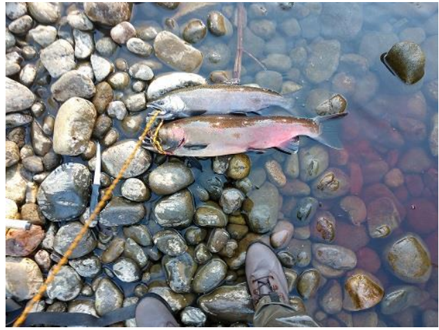
Silvers from Tilton River