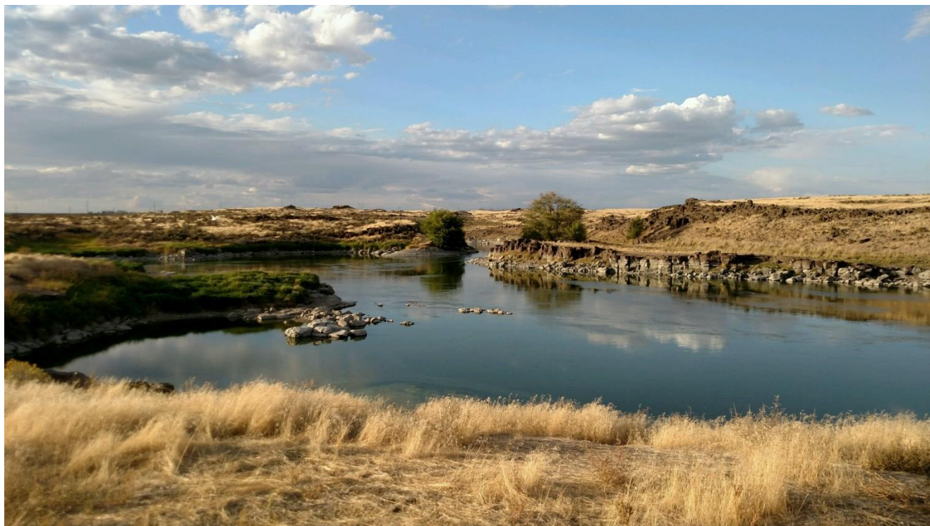
Scenic view of Soda Lake near Potholes Reservoir