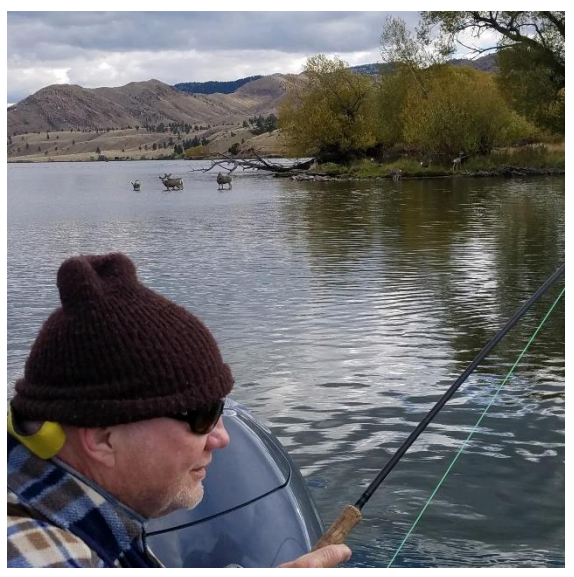
Onlookers while landing fish