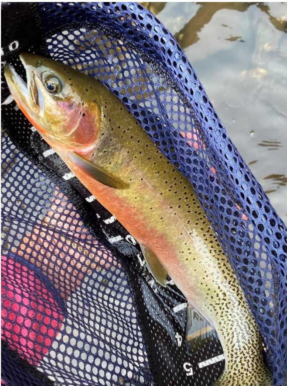
Earl Betts from September on the St. Joe River in Idaho

Do you have a picture from your latest fishing adventures? Be sure to send it, with your descriptive caption to sof.psa@hotmail.com for your chance to have it be featured in the Hog Pen.