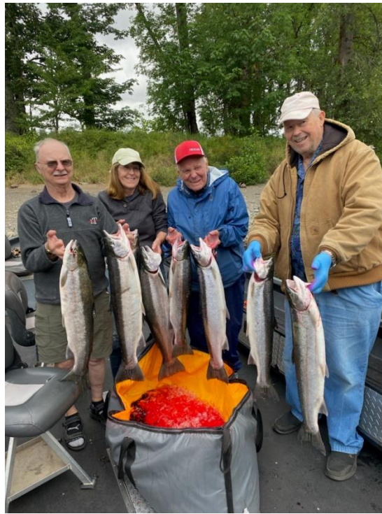
Cowlitz River Steelhead